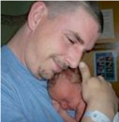
Bristol, trisomy 18, USA

Parents may be told that a baby diagnosed with trisomy 13 or trisomy 18 is incompatible with life or that the condition is 'lethal' (Koogler et al., 2003).